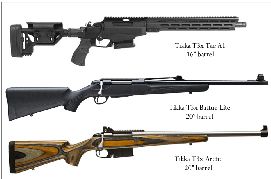
Tikka T3x Tac A1 16" barrel